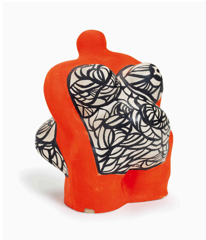
Niki de Saint Phalle-Nana Boule 1972 Notice the organic shape, and imagine the organic form this sculpture would have if you held it in your hands.

Organic: Shapes or forms that are made up of loose curved lines. They are abstract or resemble objects found in nature: the shape of a puddle, a bunch of bananas, a caterpillar.