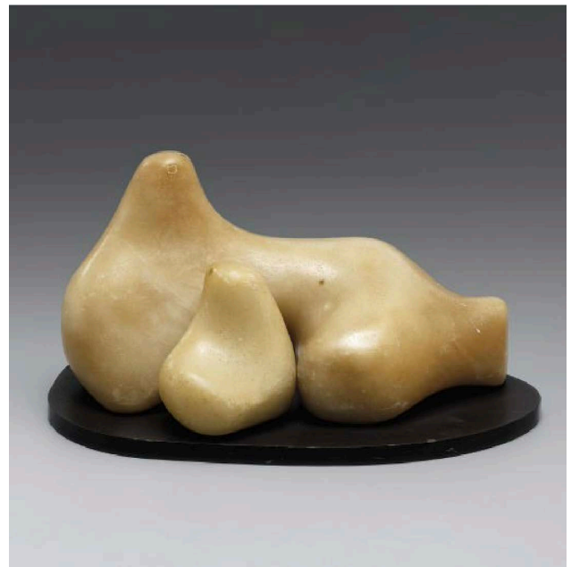
Dame Barbara Hepworth - Mother and Child Notice the organic abstract shape placed on a geometric/oval base