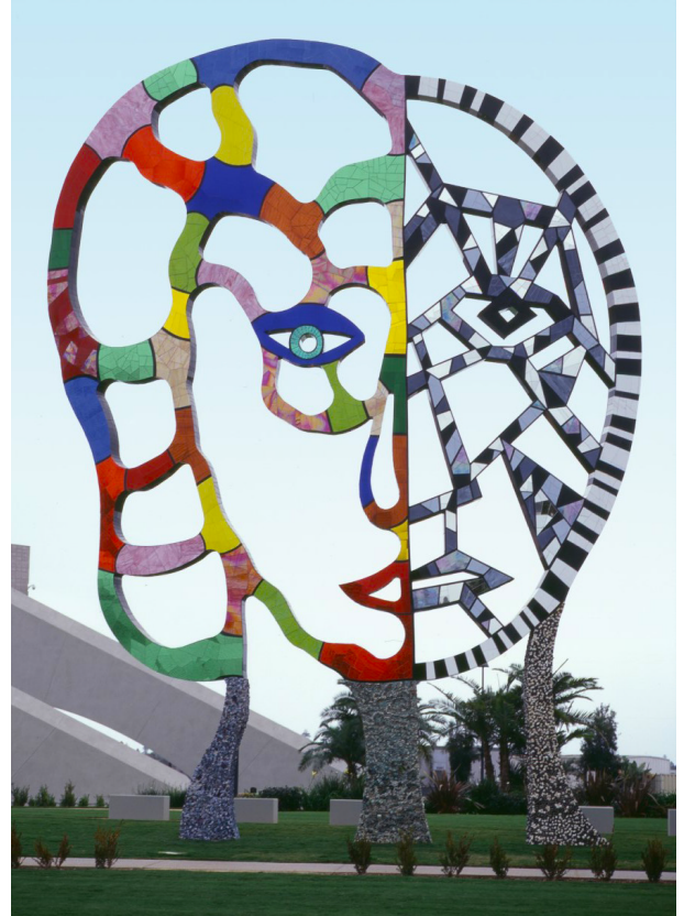
Niki de Saint Phalle-Coming Together 2001 Notice the organic and geometric shapes created by the negative space within the face of the sculpture.

• Examples of some of the reoccurring animals in the artists work: Birds, Reptiles (Dragon, Alligator, Snakes) Rhinos, Cats, Horses