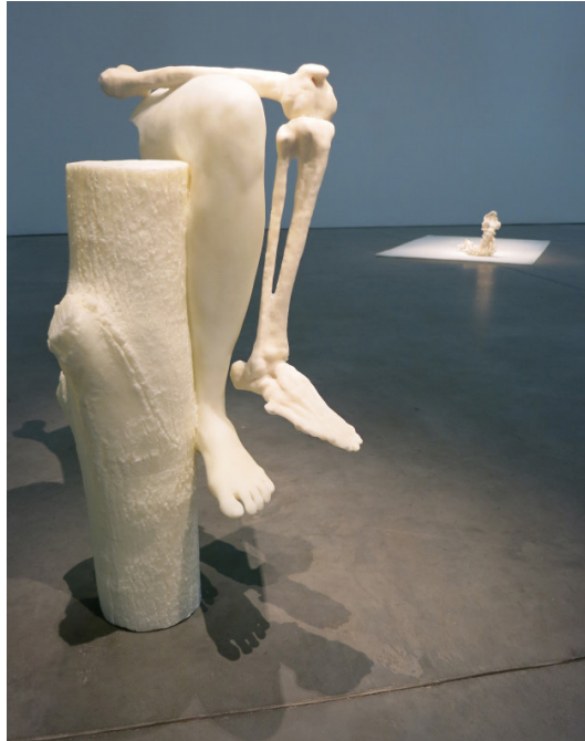
Janine Antoni-Graft 2013 Notice the unity created by the monochrome aspect of the sculpture