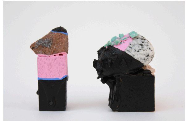
Chantal Wnuk-San Diego Objects 2016 Notice the mixed materials used in these sculptures, stone, wood, and paint.