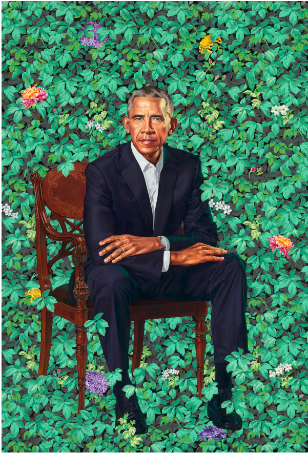
Kahendi Wiley - Painter President Barack Obama 2018

The lush background symbolizes former President Obama's personal story: Jasmine represents his birthplace of Hawaii, African blue lilies are an homage to his Kenyan father, and Chrysanthemums are the official flower of Chicago.