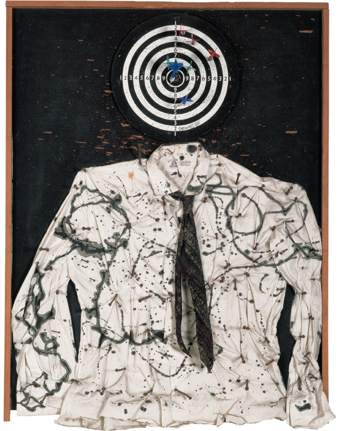
Niki de Saint Phalle- Portrait of My Lover Notice how the artist used a collection of objects to represent her "lover" without actually creating his face.

• In the United States, Niki made a sculpture garden. Located in Escondido, Queen Califia's Magic Circle is filled with totems covered in