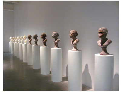
Janine Antoni Sculptor, Photographer, Performance Artist Lick and Lather 1994

"Lick and Lather" is a sculpture consisting of 14 busts made of chocolate and soap. The artist bit, gnawed, and licked the chocolate busts to alter its features, and bathed with, and washed the soap busts to do the same.