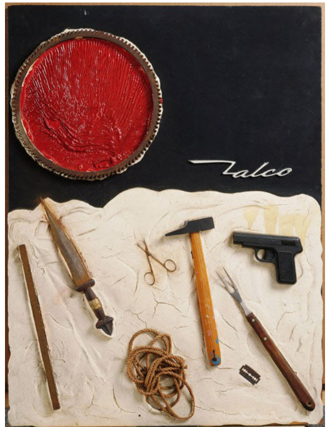
Niki de Saint Phalle Tu est Moi 1960 Notice the collected material used in this assemblage, everyday tools and a toy gun.

Balance: the sense of distribution of a visual weight.