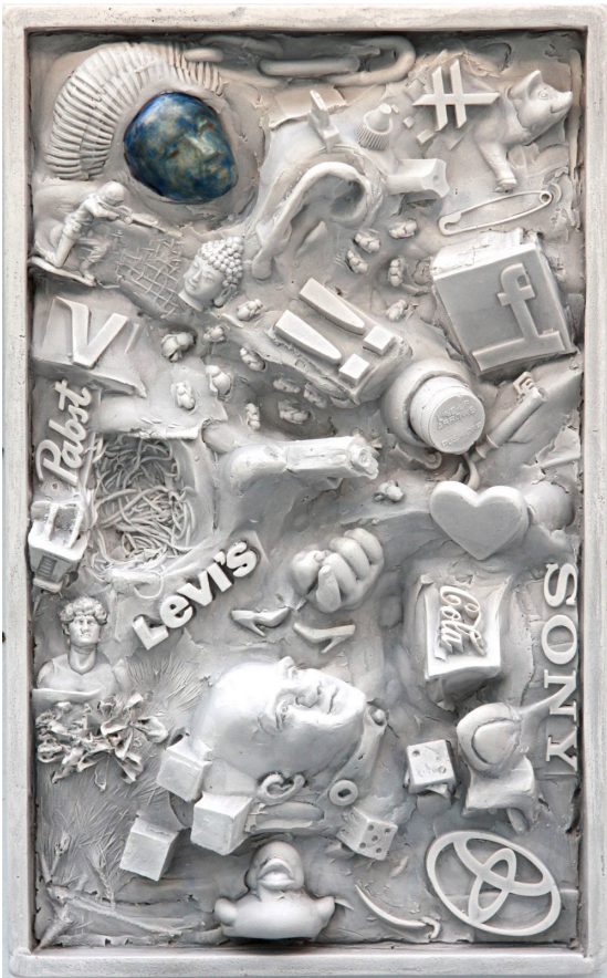
Bob Clyatt Sculptor Cultural Landscape Series #45,

Bob Clyatt is an artist that uses objects that reflect current cultural themes, and creates molds to make assemblages that are a snap shot of current societal and cultural times. In this piece you can see a combination of parts toys, ordinary house hold items, and logos of all types.