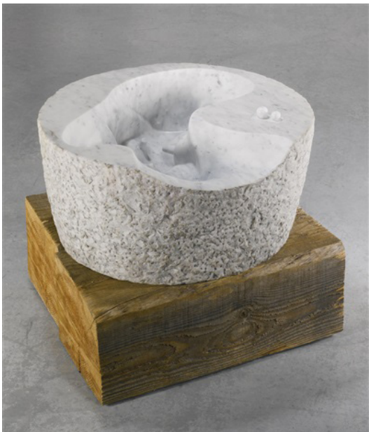
Louise Bourgeois-Fear Four Notice the organic negative space within the sculpture. and the use of mixed materials, wood and marble.