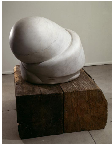
Louise Bourgeois-Sleep II Notice the organic abstract shape placed on a geometric wooden base