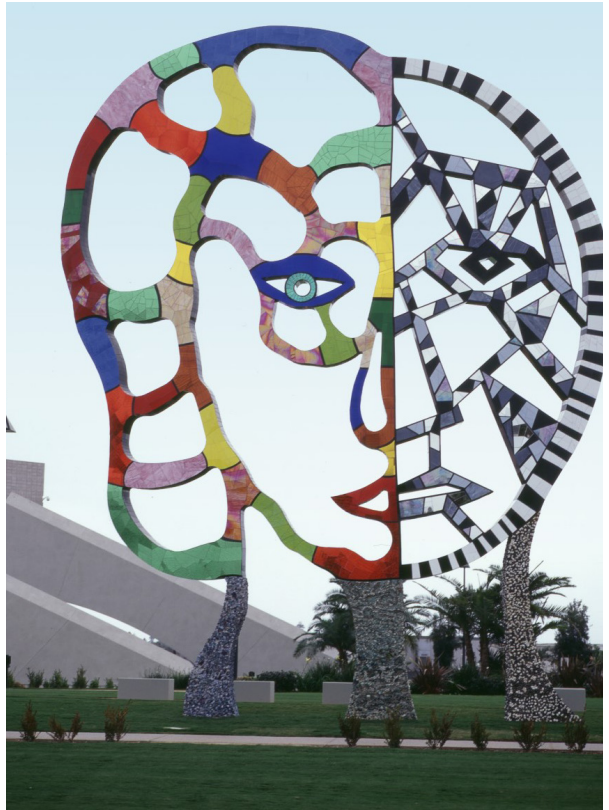
Niki de Saint Phalle-Coming Together 2001, Notice the organic and geometric shapes created by the negative space within the face of the sculpture.

• Located in Escondido, Queen Califia's Magic Circle is filled with totems covered in Mosaics of mirrors, hand made tiles and a variety of stones and quartz. This was a gift to the people of California, since Niki lived in Southern California from 1993 until her death in 2002. In this sculpture garden, Niki has made many totems that are meant to honor Queen Califia.