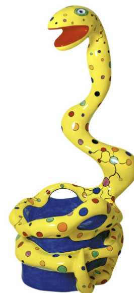
Niki de Saint Phalle Pouf Serpent (Snake Chair) 1991

Notice the organic shape, and imagine the organic form this sculpture would have if you held it in your hands.