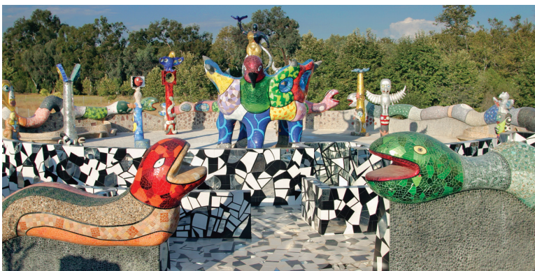
Niki de Saint Phalle Queen Califia Magic Circle 2002, Notice the organic and geometric shapes created by the sculptures in the garden